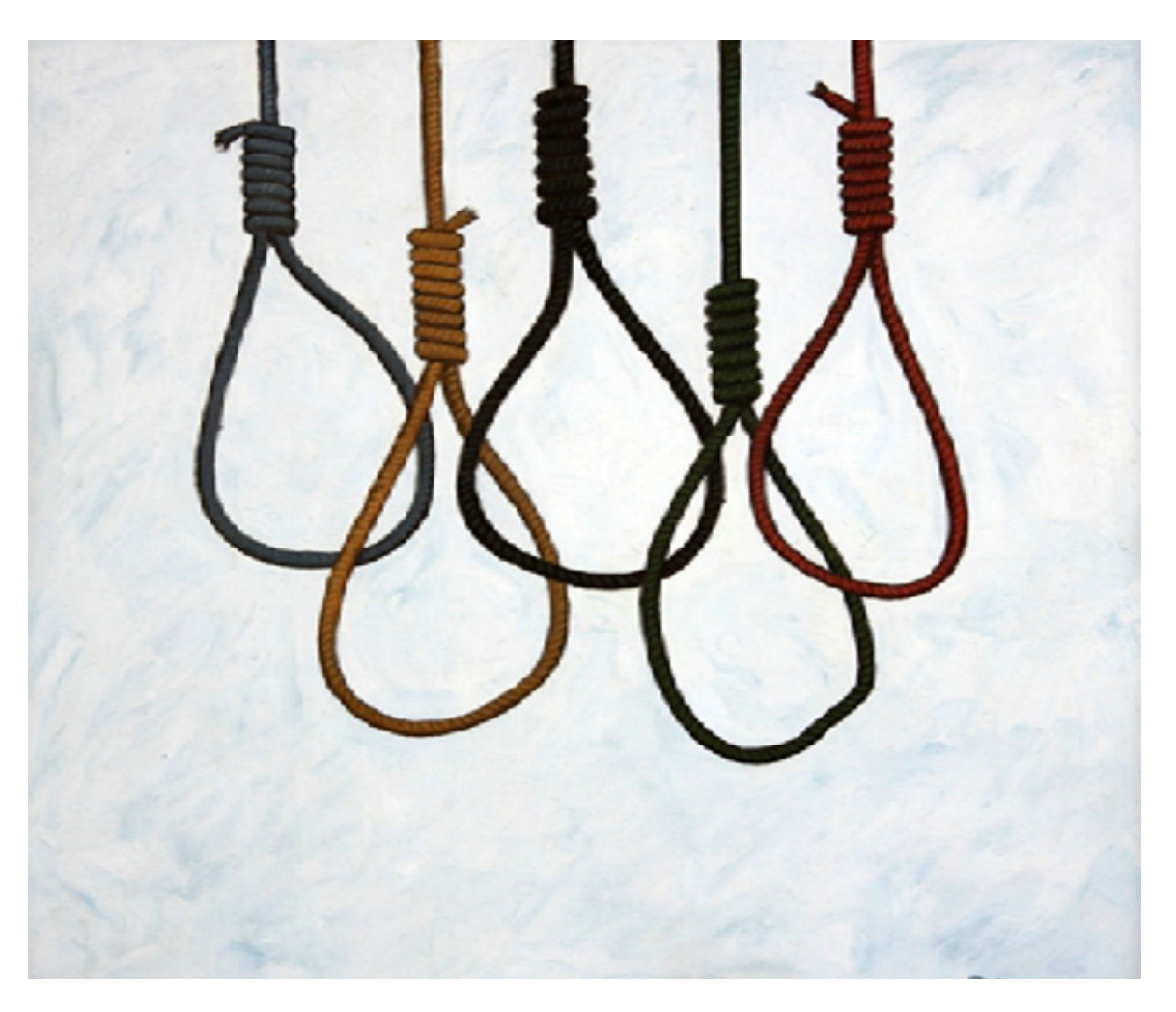
Russian Federation Anti-Gay Laws: An Analysis & Deconstruction