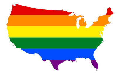
Yes Since July 1, 2003